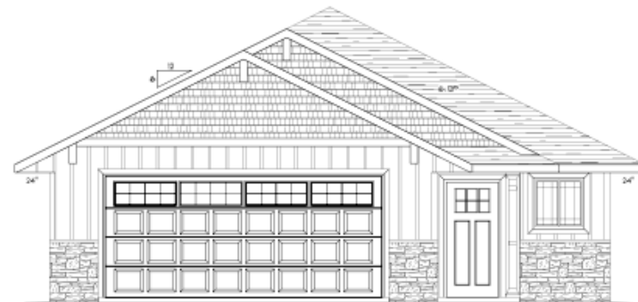
FRONT ELEVATION SCALE 1/4" = 1'-0"