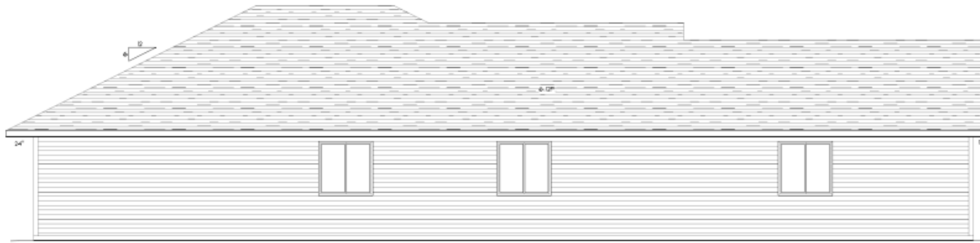
LEFT ELEVATION SCALE 1/4" = 1'-0"