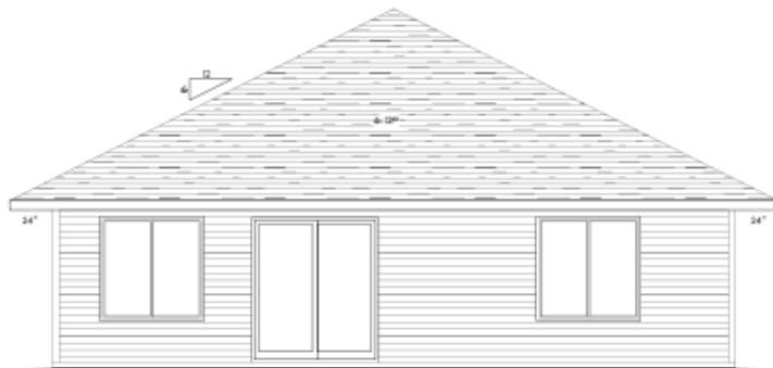
REAR ELEVATION SCALE 1/4" = 1'-0"